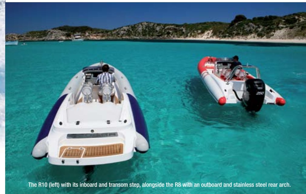
The R10 (left) with its inboard and transom step, alongside the R8 with an outboard and stainless steel rear arch.