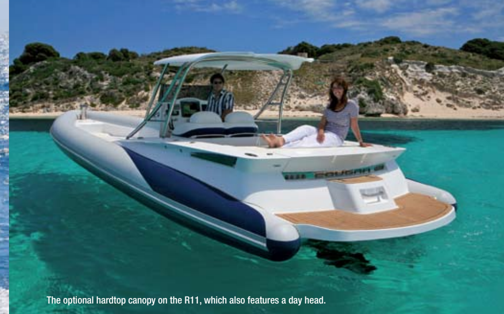
The optional hardtop canopy on the R11, which also features a day head.