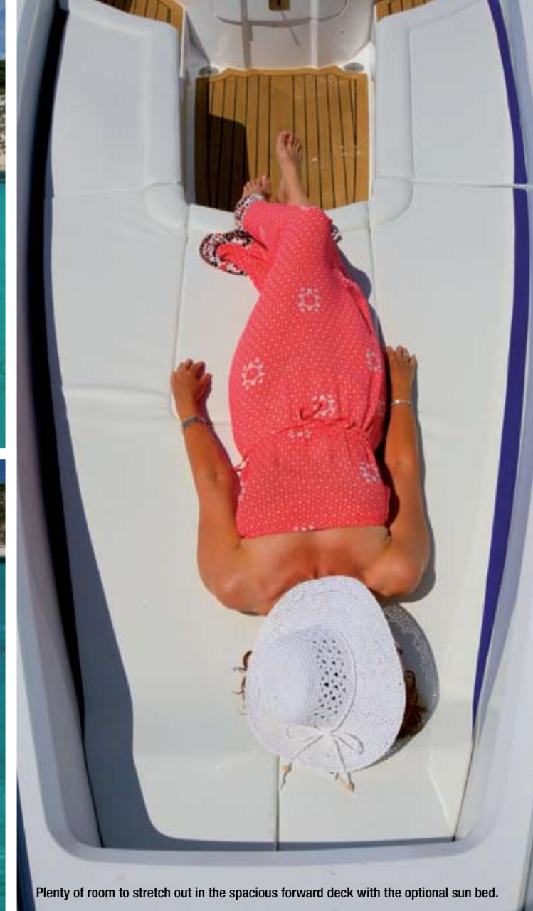
Plenty of room to stretch out in the spacious forward deck with the optional sun bed.