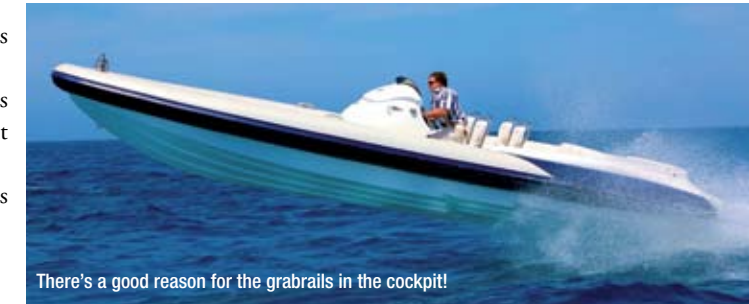
There's a good reason for the grabrails in the cockpit!