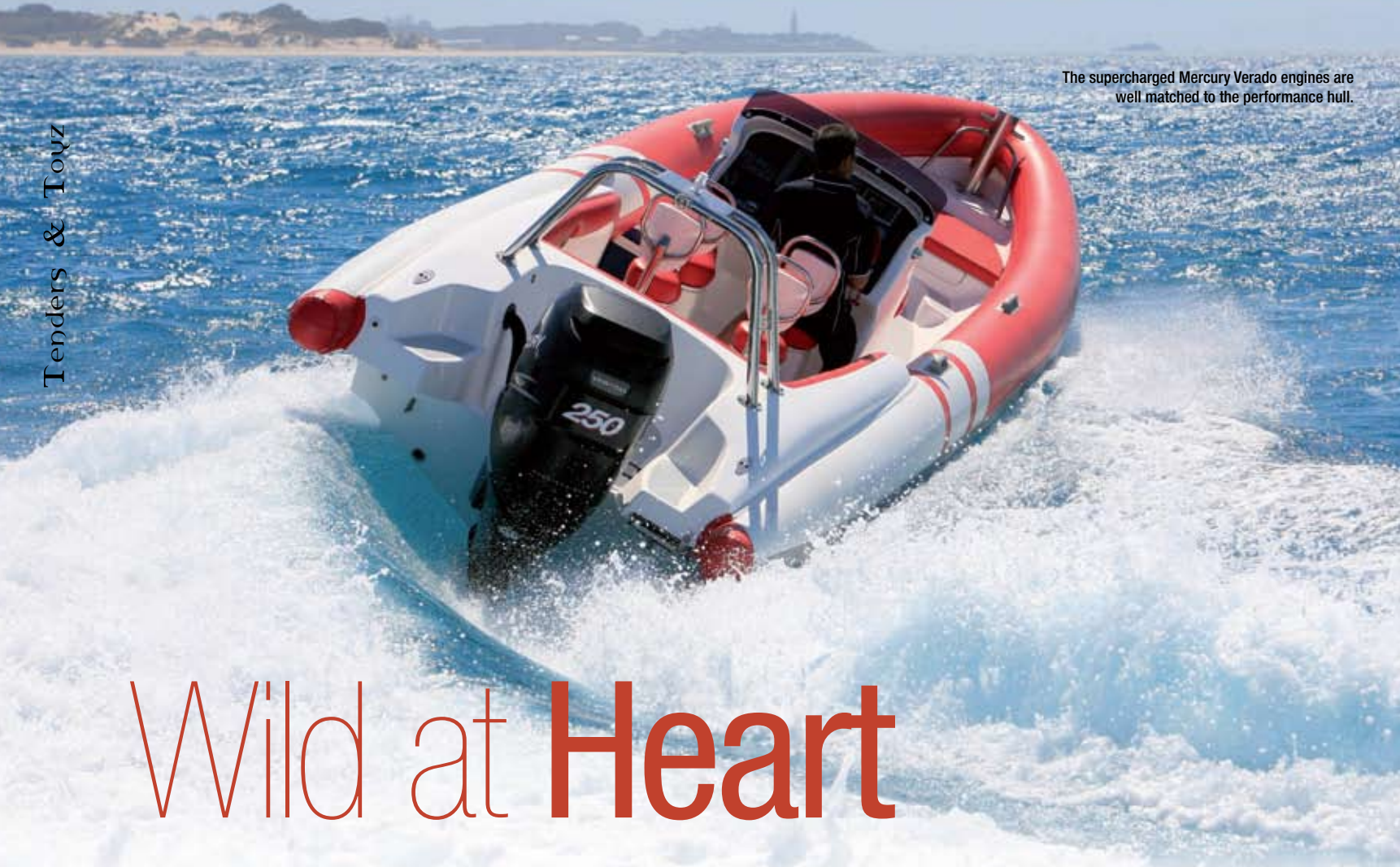
The supercharged Mercury Verado engines are well matched to the performance hull.